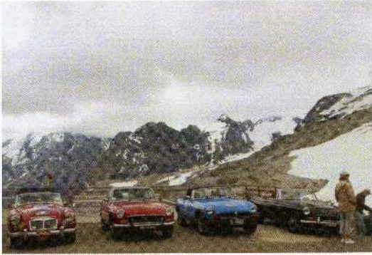
On top of the Stelvio Pass.

to the hotel. The road surface was rough which was uncomfortable with the MG's firm suspension but the drive worth the effort. It was a long drive and quite a tough one through the many passes and we were all tired at the end of a long day. We enjoyed an excellent dinner before all retiring for a well earned and sound sleep.