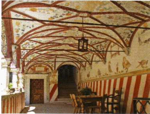
Churburg Castle loggia

We then drove up through Alsace Lorraine visiting the many beautiful towns in the area including Colmar, Riquewhir and Strasbourg, all packed with half timbered house, cobbled streets and fountains before making our way to Aachen to view the tomb of Charlemagne in the spectacular cathedral dazzling with mosaics and golden sarcophagi.