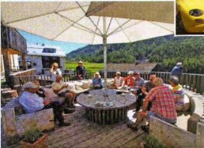
Coffee break at the Hotel Cadonai

The following day was less tiring. We drove through three countries, Italy, Switzerland and the tax free enclave of Livigno. The road was less winding but the scenery still superb. We drove over the Pass Dal Fuorn before we stopped for coffee at the Hotel Cadonai,