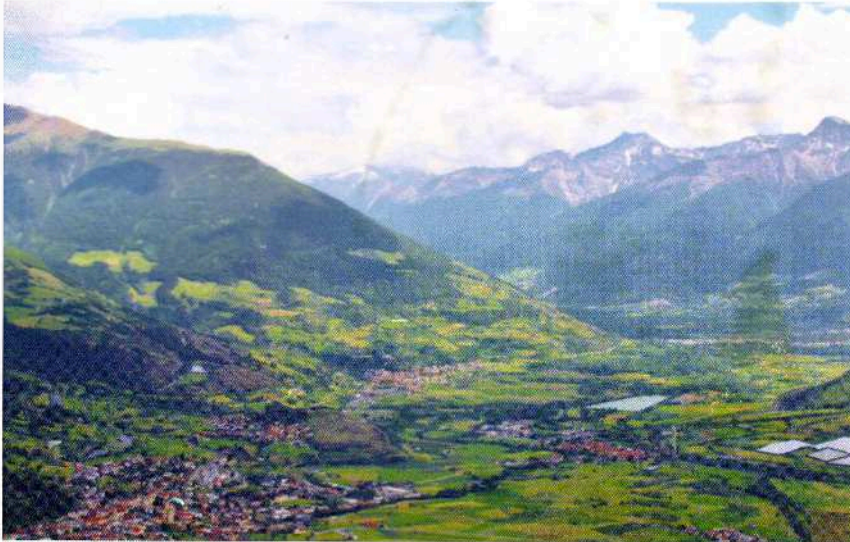
The View from the Watles Hotel